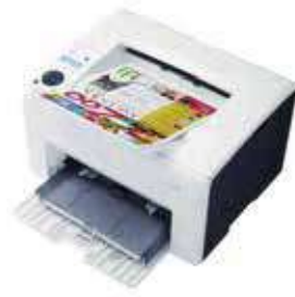
Color printing Support by external printer