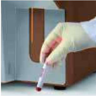
Minimized injury for animal Sample volume 20 \mu L