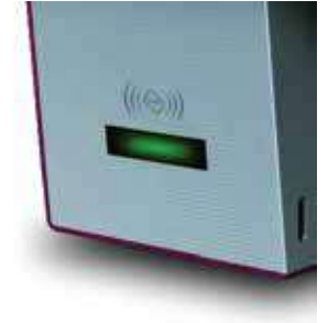
Build-in card reader Secure closed system