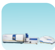
Laser Particle Size Analyzer