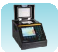
PCR/Gradient PCR/ RTPCR