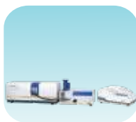
Laser Particle Size Analyzer