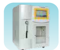
Liquid Partical Counter