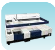
Fully Automated CLIA