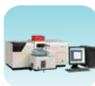
Atomic Absorption Spectrophotometer