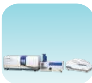
Laser Particle Size Analyzer