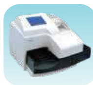
URINOVA 2800 Urine Analyzer