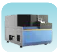
Optical Emission Spectrophotometer