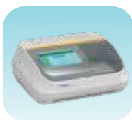
Micro Plate Reader/Washer