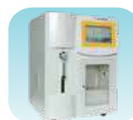
Liquid Particle Counter