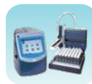
Total Organic Carbon 3800