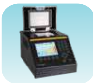
PCR/Gradient PCR/ RTPCR