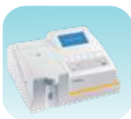
Semi Auto Bio Chemistry Analyzer