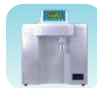
Water purification system