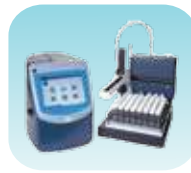
Total Organic Carbon 3800