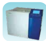
Optima Gas Chromatograph 2979 Plus