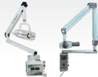
Dental X-ray machine