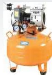
Oil Free compressor