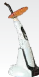
LED Light Cure