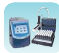
Total Organic Carbon 3800