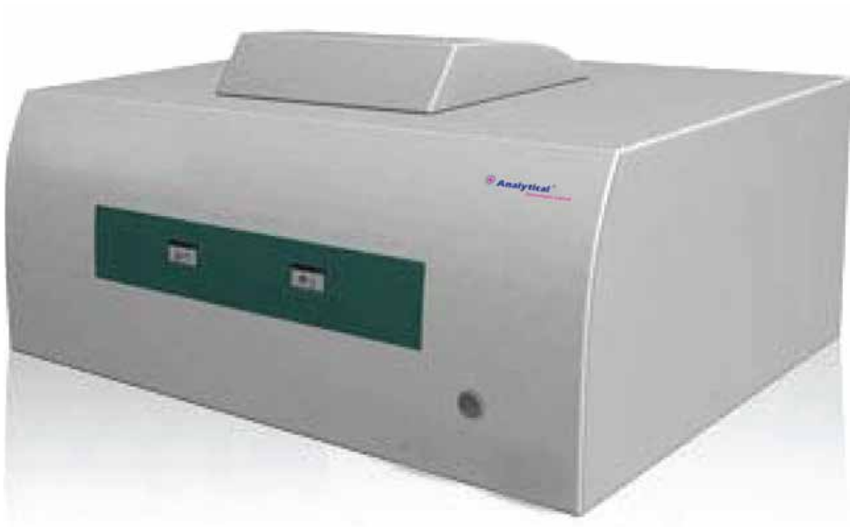
DSC- 2200 differential scanning calorimeter (DSC)