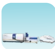
Laser Particle Size Analyzer